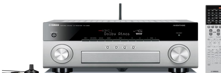
The Home Cinema amplifier RXA-860

Another prestigious brand has shown great confidence in Qobuz from today: Yamaha has announced the integration of Qobuz with some of its MusicCAST products. This multiroom 1 technology, a revolution in the music world, allows for a precise control of the listener's desired sound space. Fans of 24-Bit Hi-Res will have every opportunity to stream their music on Qobuz in superior sound quality via the intuitive and ergonomic Yamaha MusicCAST application, which is compatible with both iOS and Android. The application supports a complex search engine, facilitates album and artist discovery, allows access to playlists, management of favourites, and more. In all, there are 11 Home cinema amplifiers and 2 MusicCast Gateway that are compatible with Qobuz and make the musical experience even more exhilarating thanks to the WXA-50 and WXC-50 gateways.