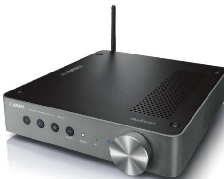
MusicCast Gateway & WXA-50 Amplifier 2